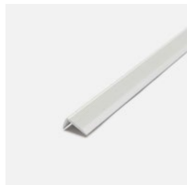
MULTI ANGLE 3400 x 19 x 7mm