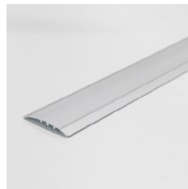
COVER TOP 3400 x 45mm