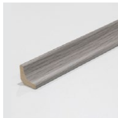
SCOTIA 2400 x 19 x 19mm