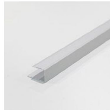
MID END 3400 x 19 x 12mm