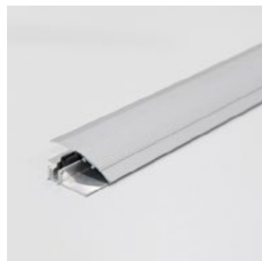
UNIVERSAL 3400 x 45mm